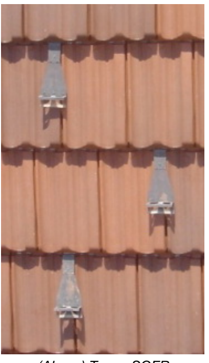
(Above) Type - SGFR Gough SnoGuard installed

The Type SGFR Gough SnoGuard<sup>™</sup> is actually the Type SGAR with a custom designed strap added to interlock with the Ludowici-Celadon clay roof tile.